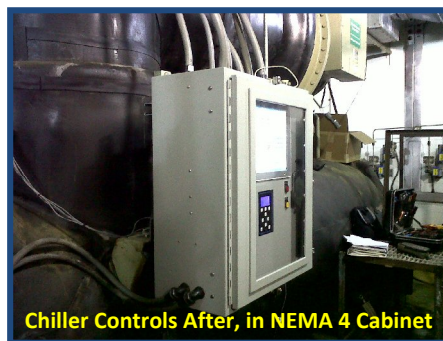
Chiller Controls After, in NEMA 4 Cabinet