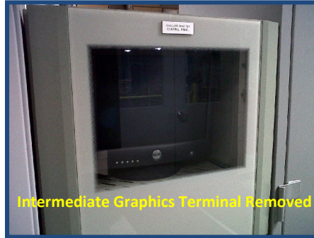
Intermediate Graphics Terminal Removed

Had to keep one chiller running to maintain continuous plant operation