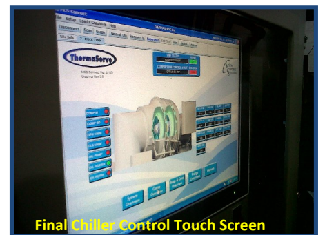
Final Chiller Control Touch Screen

ThermaServe Mechanical Systems Services 6676 Columbia Park Dr. South * Jacksonville, FL 32258 * www.thermaserve.com T (904) 260-8002 * F (904) 260-8004 * sales@thermaserve.com FL#CMC057091 * GA#CN209367