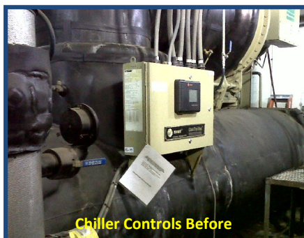
Chiller Controls Before

Customer was looking for a solution that they could not get from the original equipment manufacturer. The independent solution ThermaServe provided for the customer reduced and simplified the operation and provided them a reliable product with the capability of in-house support, as a non-proprietary solution. We were also able to provide the customer with more points to monitor in their control system, essentially providing a constant chiller logging capability. This visibility now enhances their operational support.