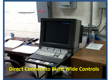
Direct Connect to Plant Wide Controls